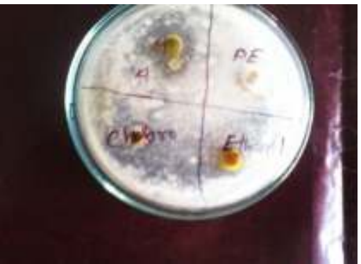
Nyctathes arbor-tristis against A. flavus