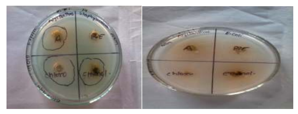
Nyctanthes arbortristis against S. aureus.